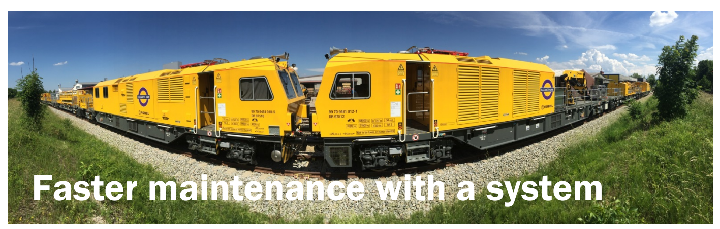
Fig. 1: RORUNNER system for the London Elizabeth Line consists of two train formations, each with two track vehicles and one transport transport wagon.

There is increasingly less time for rail maintenance in an urban environment. Modular vehicle systems speed up the transport and work processes with the aim of completing maintenance and fault intervention within short possessions.