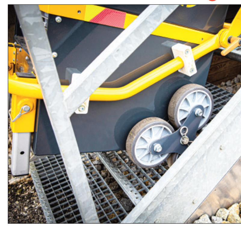
Robel rail/road trolley has been specially designed for easy transport of the high capacity battery pack and other materials, which might be required at the worksite.