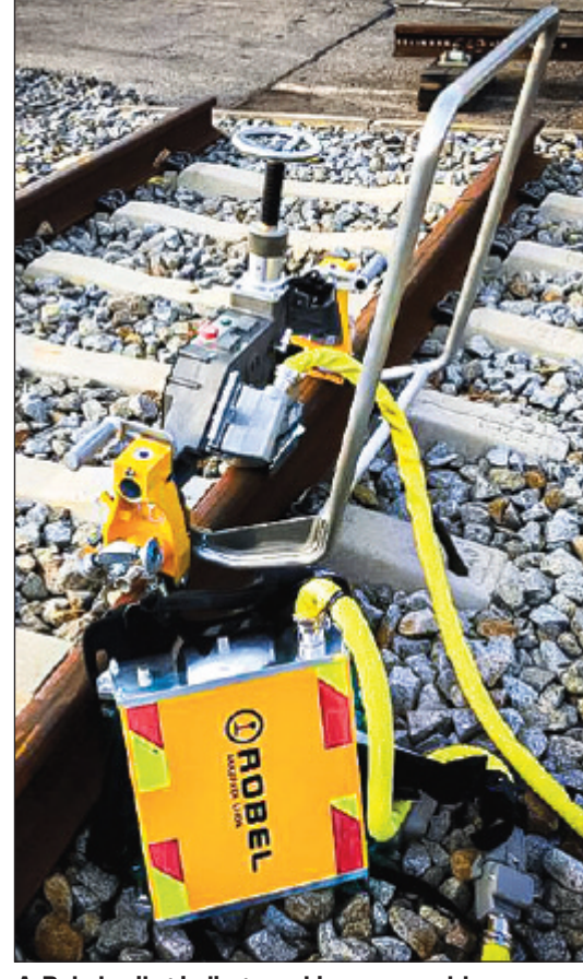
A Robel rail grinding machine powered by a 2kWh battery.

The portable battery pack with its approximately 18kg is carried to the worksite by the operator like a comfortable rucksack or